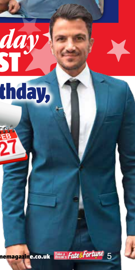
Compiled by Carina Platt